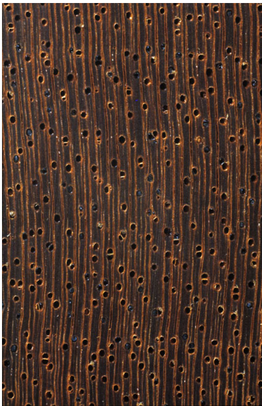
Macroscopic cross-section of Khaya (10 times magnification lens)

Outdoor or indoor use. Especially suitable for: Outdoor construction with no ground contact, decorative veneer, rotary cut veneer (for plywood) (predominantly in boat building), frame structure (windows, house doors, conservatories), wall and ceiling coverings (inside), furniture (almost equal substitute for genuine mahogany ( Swietenia macrophylla ), especially in the reproduction of period furniture, e.g. Biedermeier, Chippendale, Empire), other uses: often applied in boat building, solid or laminated, for almost all components except wooden frames bent using steam.