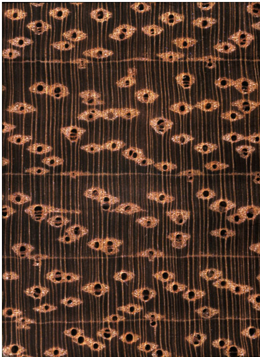
Macroscopic cross-section of Afzelia (10 times magnification lens)

Afzelia is especially suitable for solid wood use because of its good physical, biological and mechanical properties: In outdoor construction, following the relevant surface protection, for example for windows and doors, in indoor construction for floors (parquet), stairs, handrails, frame structures, high-load tables, shelves etc.