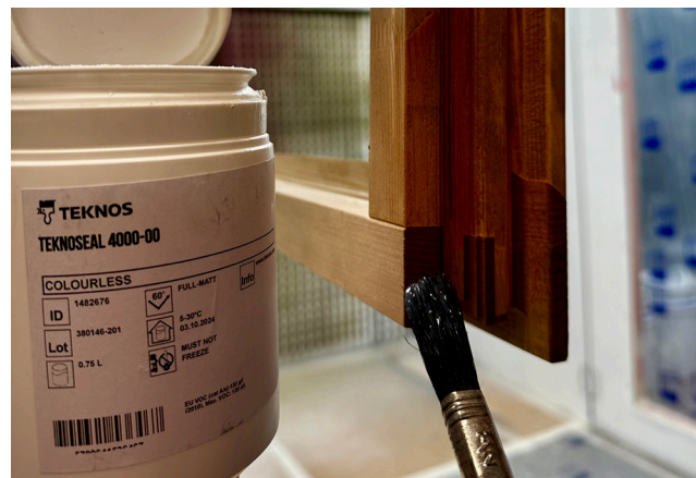
TEKNOSEAL 4000 applied by brush to exposed end grain as part of the finishing process