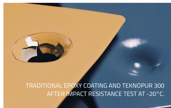
TRADITIONAL EPOXY COATING AND TEKNOPUR 300 AFTER IMPACT RESISTANCE TEST AT -20°C.

When it comes to operational temperatures, TEKNOPUR 300 offers a wide temperature area. Typical usage temperatures are from -40°C up to +150°C. ENVIRONMENTALLY FRIENDLY