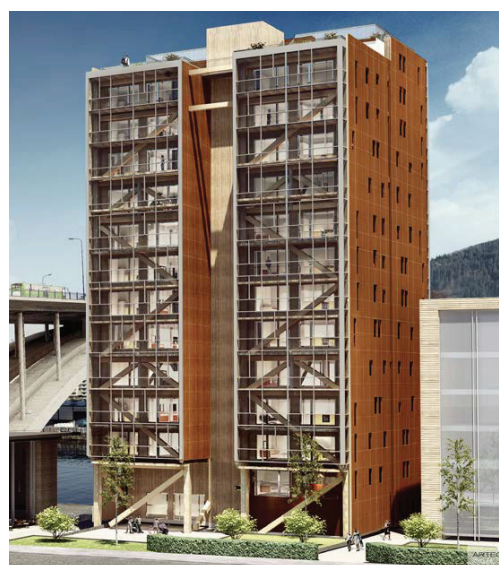
"Treet" in Bergen, Norway, the world's tallest wooden house – 52 meters high and 14 storeys. Teknos has supplied TEKNOS FR Facade and TEKNOS FR Panel.

Fire-retardant wood based products must, at the manufacturers site be certified by a "Notified Body" who issues a "Certificate of Constancy of Performance" following a prior inspection of the manufacturer's production facilities and documentation setup. The Product Standard requires that the manufacturer have a quality control system in operation. All products treated with fire-retardant products from Teknos are adapted to the Construction Product Regulation no. 305/2011 and can consequently be CE-marked.