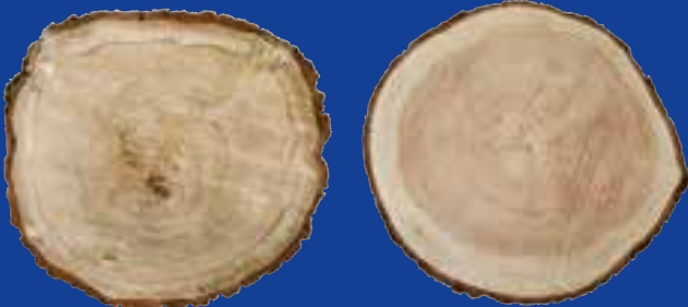
Comparison clearly shows the difference between untreated wood and wood treated against wood discoloration and wood destroying fungi.