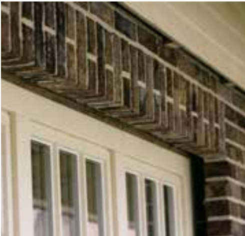
Teknos exterior wood coatings provide outstanding protection.