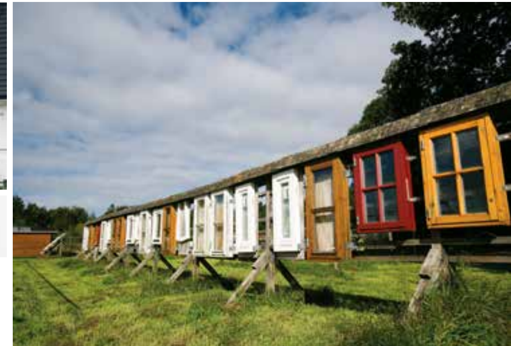
With knot sealer