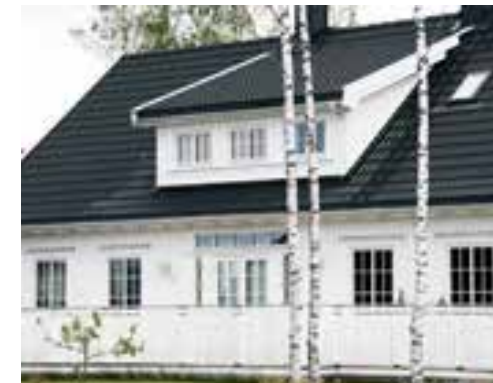
Without knot sealer

Years of intensive research and testing result in high-quality exterior wood coatings.