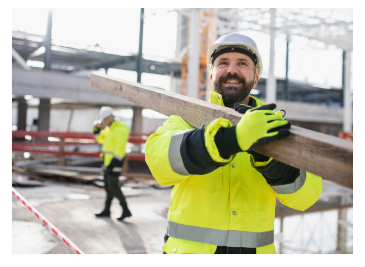
Always refer to the Technical Datasheet for full instructions on how to use Teknos products.

For further support, contact your local Teknos representative or visit teknos.com