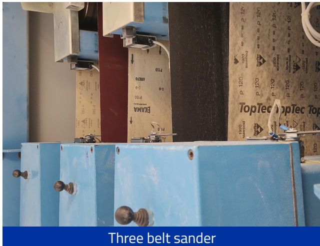
Three belt sander