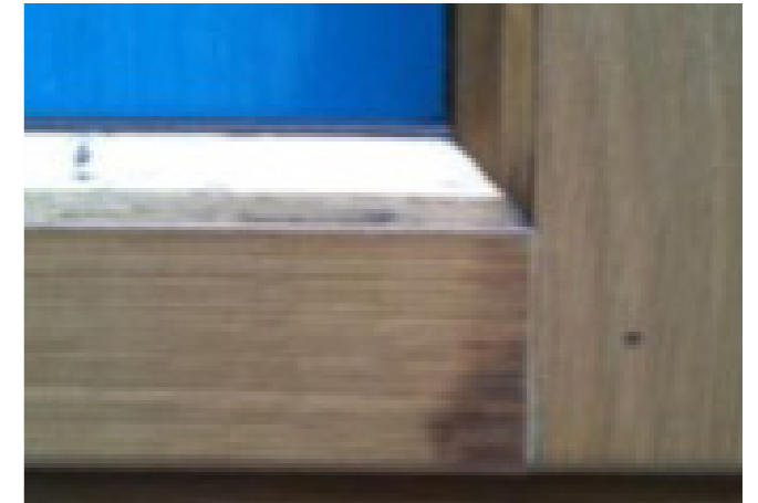
The natural movement of oak can cause joints to open allowing water to enter, react with Tannic Acid in the timber causing characteristic staining

Health and safety: Oxalic Acid is corrosive. Read carefully and follow the manufacturer/supplier's detailed guidance at all times and always wear suitable gloves, mask and eye protection when handling this product.