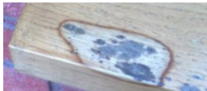
Localised staining can be sanded out using a detail sander and the coating system reinstated.