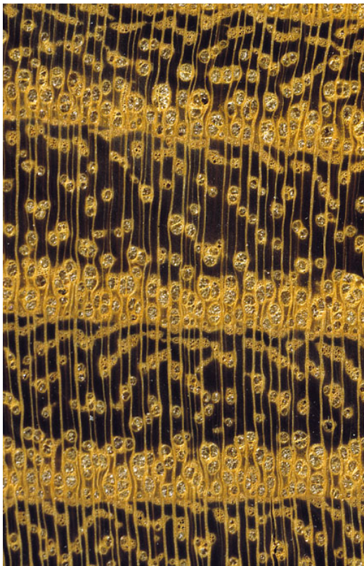
Macroscopic cross-section of Robinia (10 times magnification lens)

Outdoor or indoor use. Especially suitable for: Outdoor use with ground contact, outdoor use with no ground contact, horticulture and landscaping, children's play areas and equipment, frame structure (windows, house doors, conservatories) (only laminated profiles), floors (parquet, boards, etc.), stairs (solid and pre-finished parquet), furniture, turnery, liquid containers in the chemical industry.