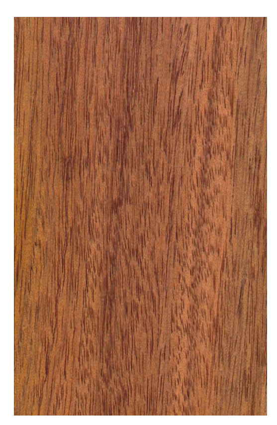
Wood surface of Mengkulang (radial section)