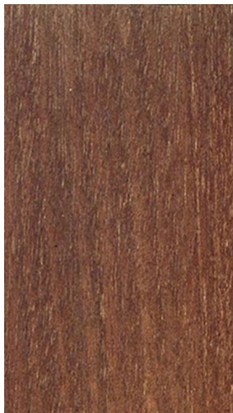
Wood surface of Dark Red Meranti (radial section)