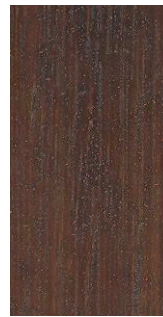
Teak treated with TEKNOSHIELD 4003

Water/ Cocking Oil surface repellency check: Large and visible spots after both water and oil being applied for longer than 1 hour.