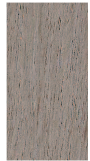
Teak treated with standard solvent based wood oil

Outdoor exposure for intensive UV and humidity