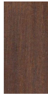
Teak treated with TEKNOSHIELD 4003

Outdoor exposure for intensive UV and humidity