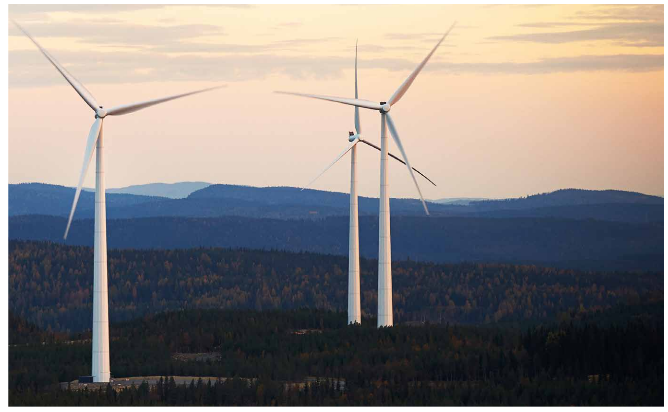
RENEWABLE ENERGY – TEKNOS COATING SOLUTIONS FOR WIND TURBINES

Teknos's core products are based on low-solvent or fully solvent-free formulations, all developed with the aim to minimize the impact on the environment and to ensure health and safety. Our compliance with the REACH chemicals legislation supports our fulfillment of safety requirements for both people and the environment.