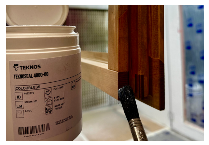
Teknoseal 4000 applied by brush to exposed end grain as part of the finishing process