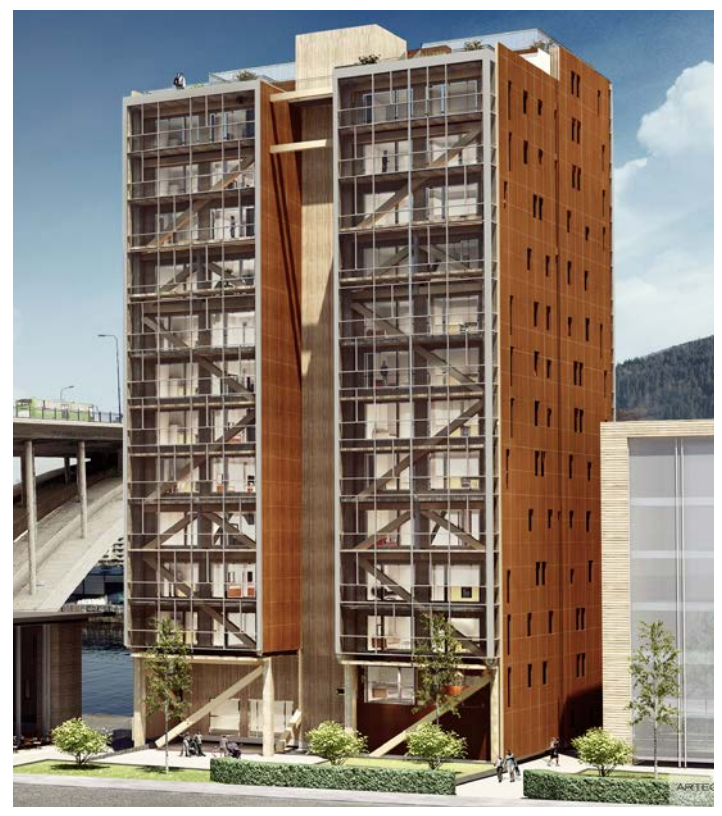
"Treet" in Bergen, Norway, the world's tallest wooden house – 52 meters high and 14 storeys. Teknos has supplied TEKNOS FR Façade and TEKNOS FR Panel.

Fire-retardant wood based products must, at the manufacturers site be certified by a "Notified Body" who issues a "Certificate of Constancy of Performance" following a prior inspection of the manufacturer's production facilities and documentation setup. The Product Standard requires that the manufacturer have a quality control system in operation. All products treated with fire-retardant products from Teknos are adapted to the Construction Product Regulation no. 305/2011 and can consequently be CE-marked.