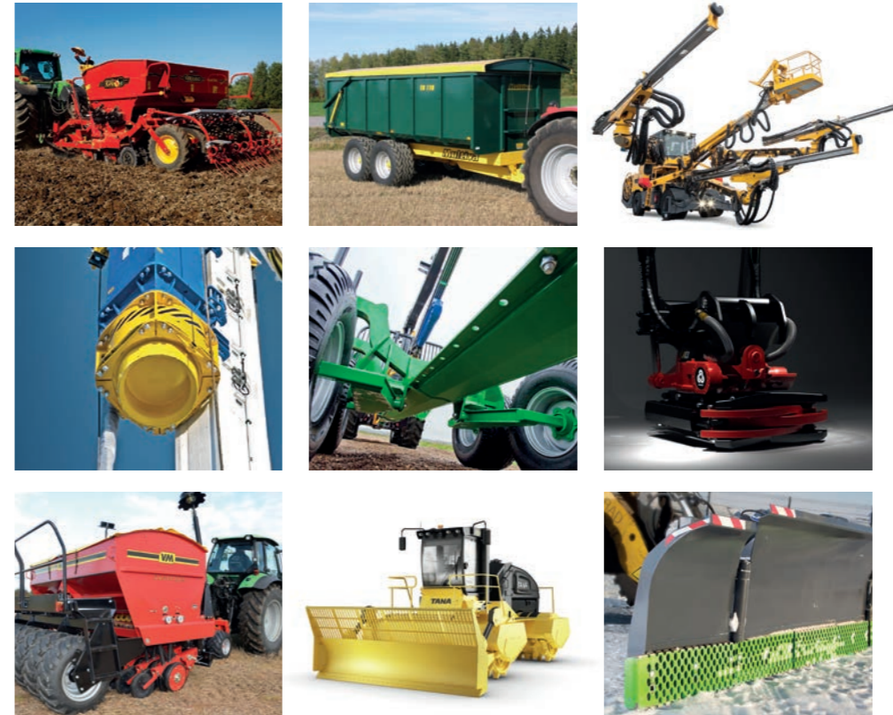
Teknos systems for agricultural, construction and earthmoving equipment

Thanks to the company's long-time focus on research and development, we are proud to be able to provide a range of best-in-class paints for agriculture, construction and earthmoving equipment.