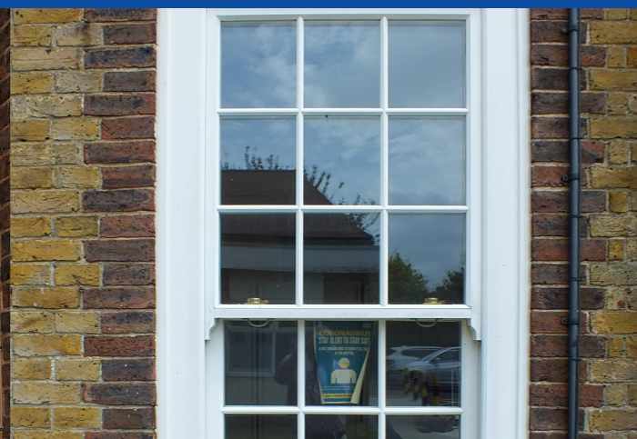
2021 Victoria Hospital, UK