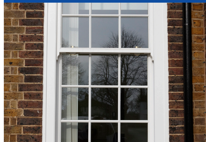
2008 Victoria Hospital, UK