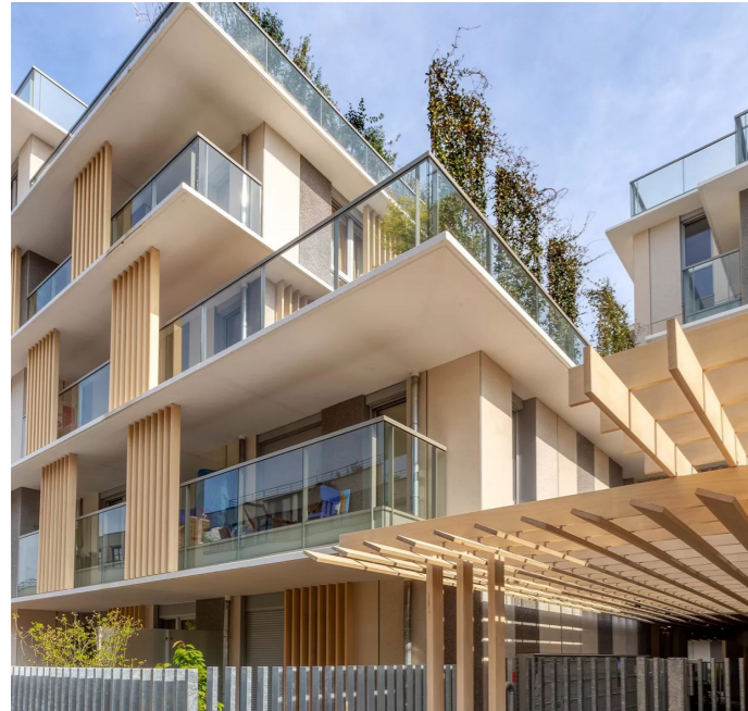
Accoya sunshades coated in AQUAPRIMER and AQUATOP