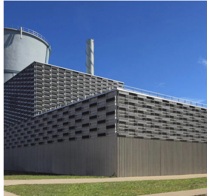
Accoya facade panels coated in TEKNOL AQUA and NORDICA EKO