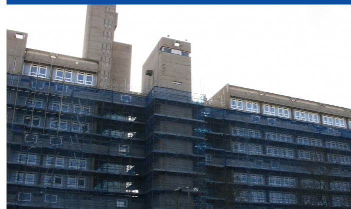
2012 Carradale House, UK