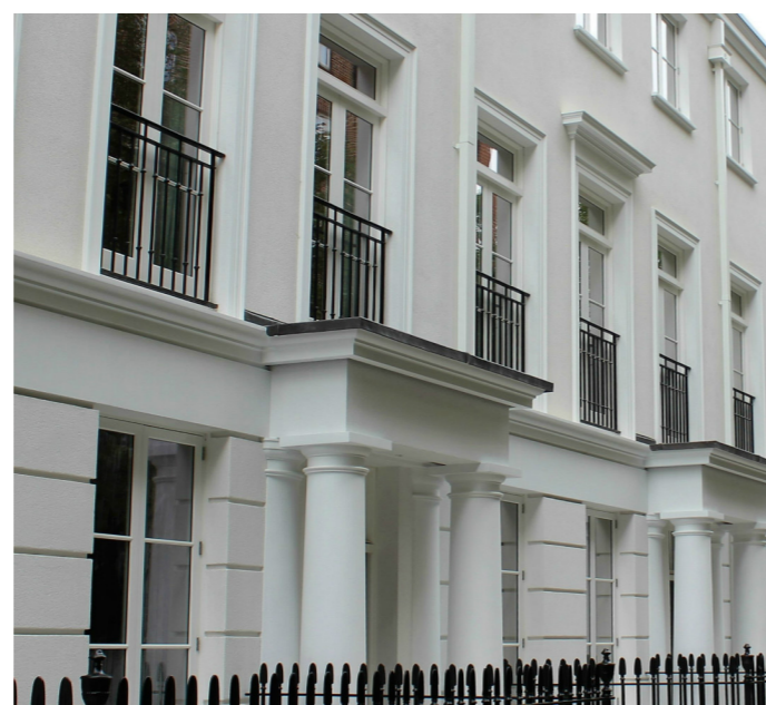
Accoya windows coated in ANTISTAIN AQUA and AQUATOP

Visit www.teknos.com for information on coating and maintenance systems and to find your nearest Teknos representative