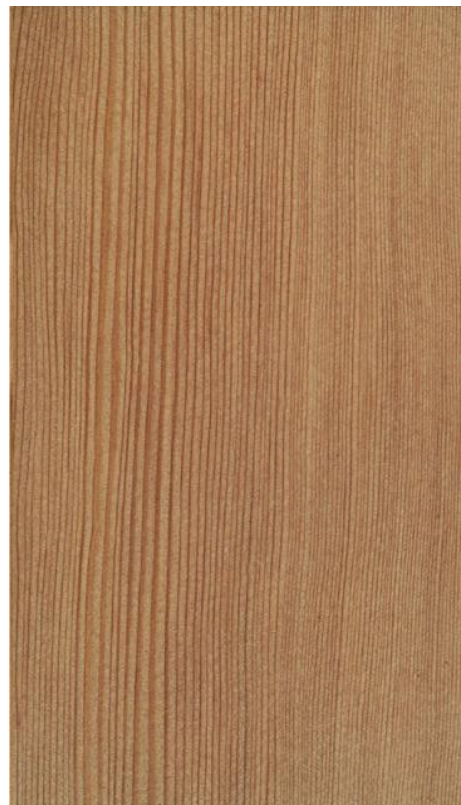
Wood surface of Hemlock (radial section)