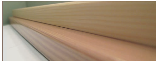
Colourless appearance highlights the natural look of the wood