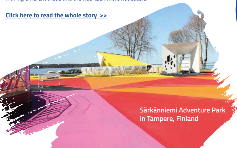
Särkänniemi Adventure Park in Tampere, Finland