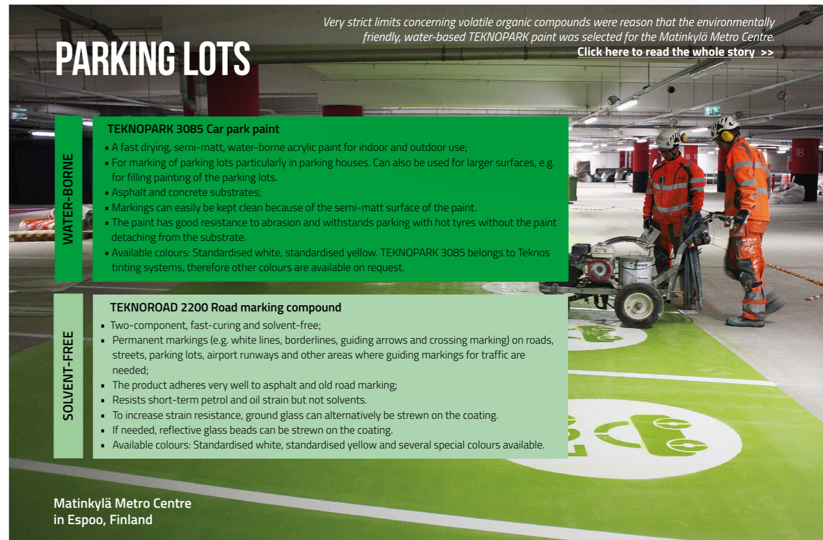
Matinkylä Metro Centre in Espoo, Finland