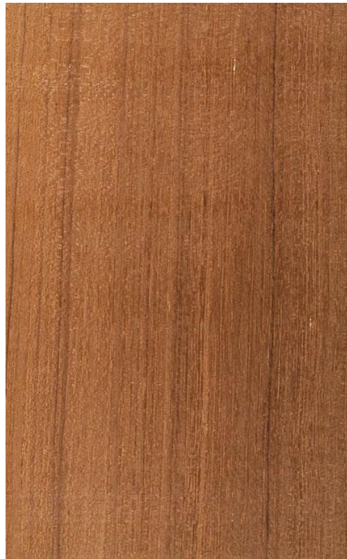
Wood surface of Teak (radial section)