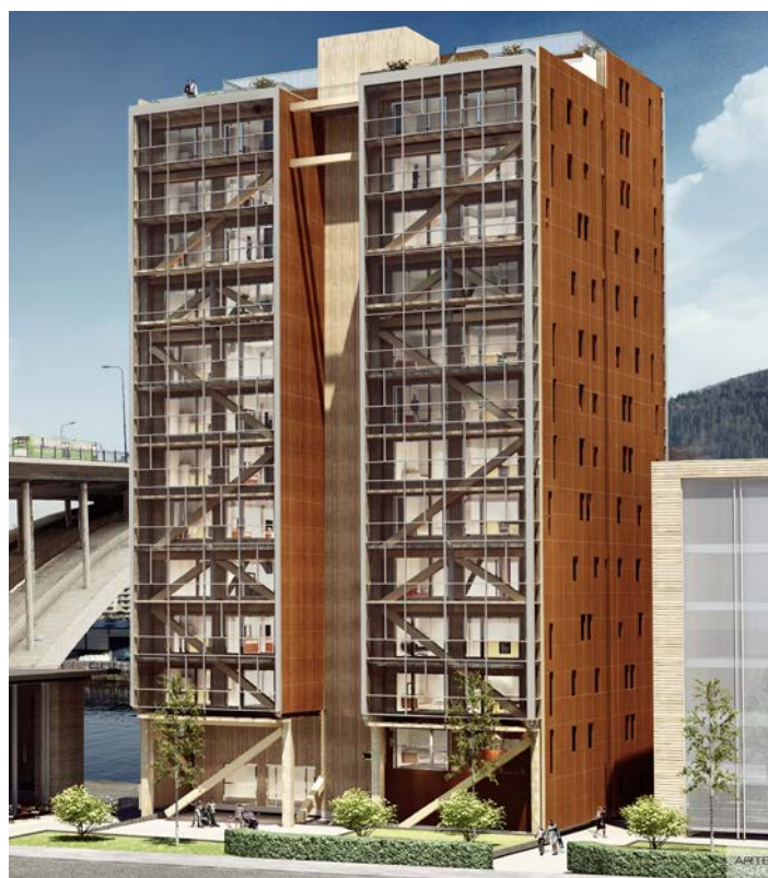
"Tree" in Bergen, Norway, the world's tallest wooden house – 52 meters high and 14 storeys. Teknos has supplied TEKNOS FR Façade and TEKNOS FR Panel.

Fire-retardant wood based products must, at the manufacturers site be certified by a "Notified Body" who issues a "Certificate of Constancy of Performance" following a prior inspection of the manufacturer's production facilities and documentation setup. The Product Standard requires that the manufacturer have a quality control system in operation. All products treated with fire-retardant products from Teknos are adapted to the Construction Product Regulation no. 305/2011 and can consequently be CE-marked.