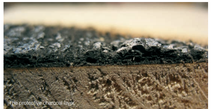
The protective charcoal layer.