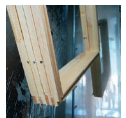
▲ Translucent AQUAPRIMER 2907-02 for flowcoating and dipping

Our technical support organisation are always ready to support you in designing your optimal coatings solution and application system.