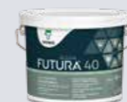
Semi-gloss FUTURA AQUA 40