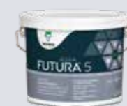
Full-matt FUTURA AQUA 5