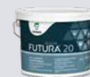
Semi-matt FUTURA AQUA 20