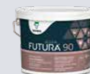
Full-matt FUTURA AQUA 90